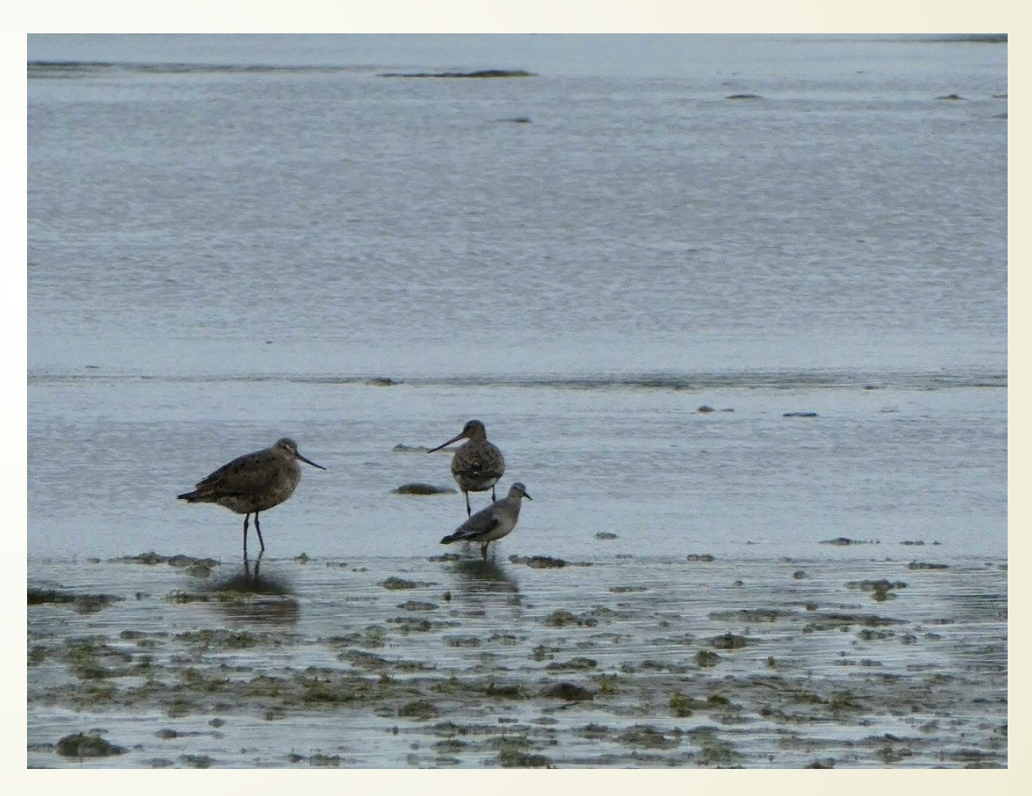
Celebrating 40 years!